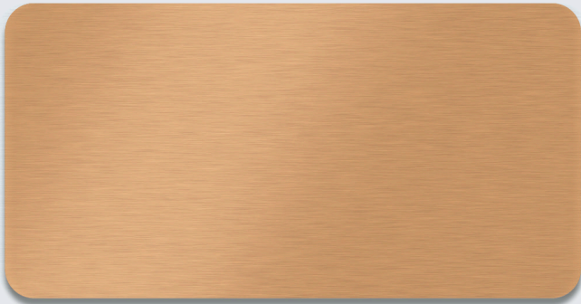
Copper Bright Brushed Anodised