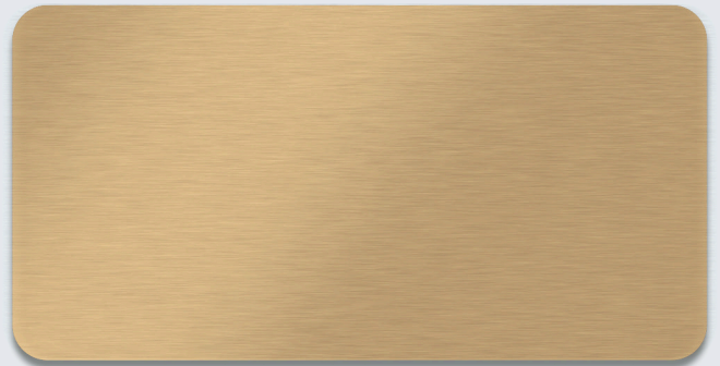
Bronze Bright Brushed Anodised