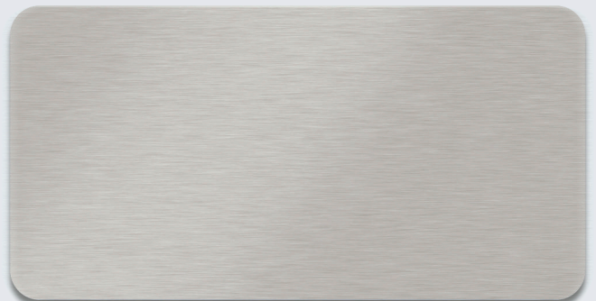
Natural Bright Brushed Anodised