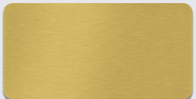
Gold Bright Brushed Anodised