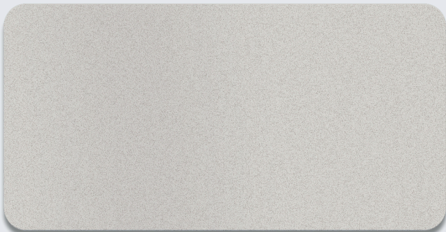
Scatter Gloss Anodised