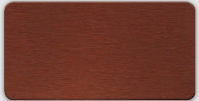
Dark Copper Brushed