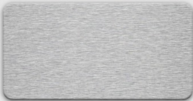
Natural BR Brushed