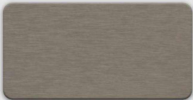
Zinc Light Grey