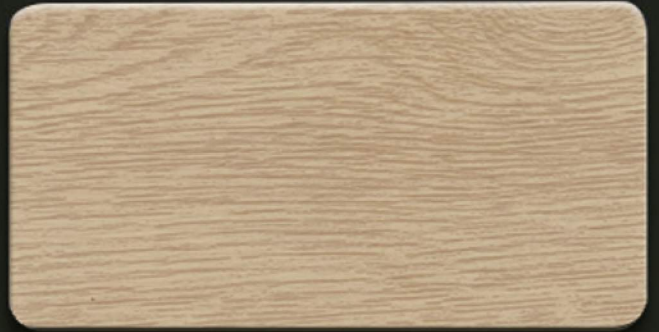
Pale Ivory Oak