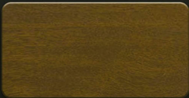
Golden Oak Light